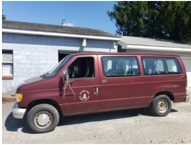
1995 Ford E250 Van