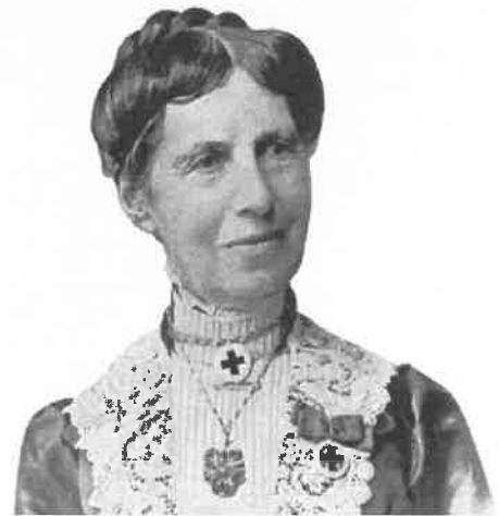
This photo of Clara Barton was taken in 1902.

After four years of this work, Clara moved to Switzerland. It was there that she first learned about a group called the Red Cross. This group worked to help people who were suffering during times of war.